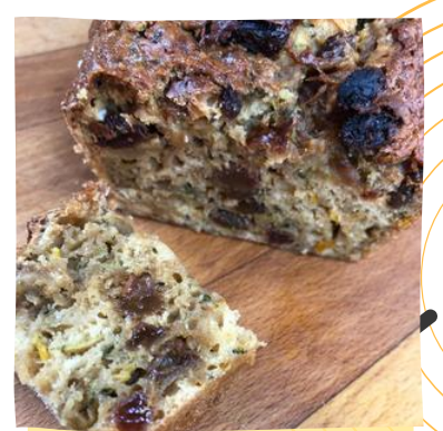
I am a bread and cake maker and no tiny Covid Virus will stop me!